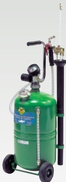
Art. 43724 24lt

with SUCTION TUBE 4 m connections for INBOARD and OUTBOARD