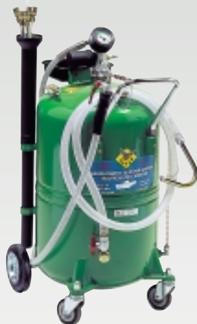
Art. 43760 65lt