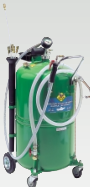
Art. 43790 90lt