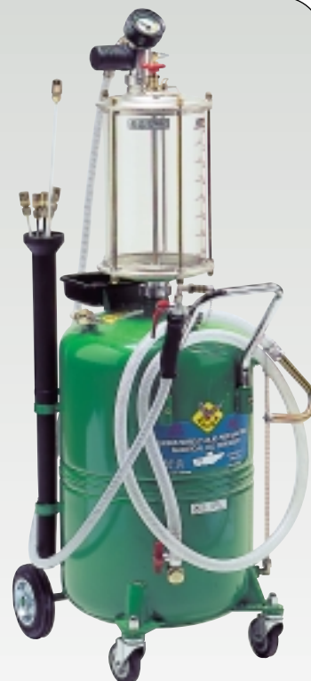
Art. 43765 65lt

Ideal for quickly changing (by probe) the oil of boat motors .